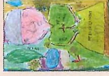
Honorable Mention Winners Title : A Girl