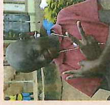
Honorable Mention Winners Title : A Girl